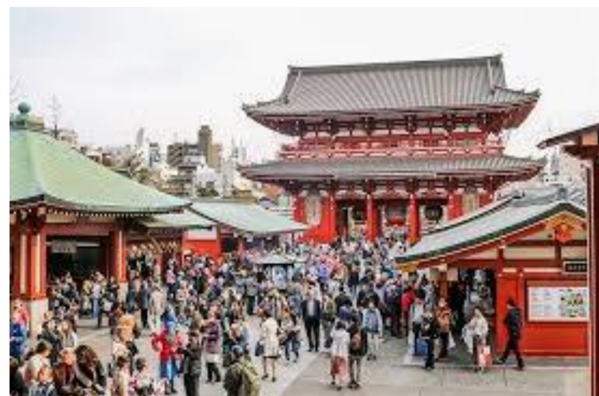
Figure 1 – How to insert a figure

Fill with text. Fill with text. Fill with text. Fill with text. Fill with text. Fill with text. Fill with text. Fill with text. Fill with text. Fill with text. Fill with text. Fill with text. Fill with text.